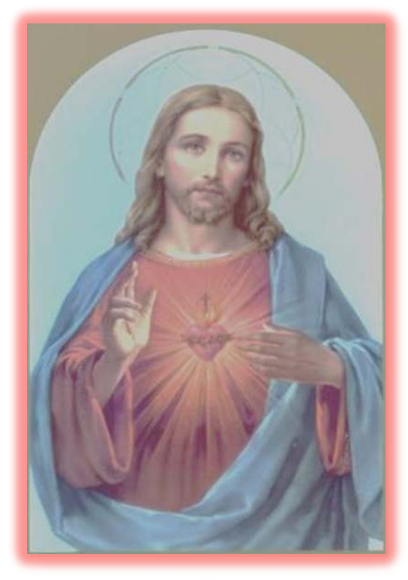
R: Have mercy on us